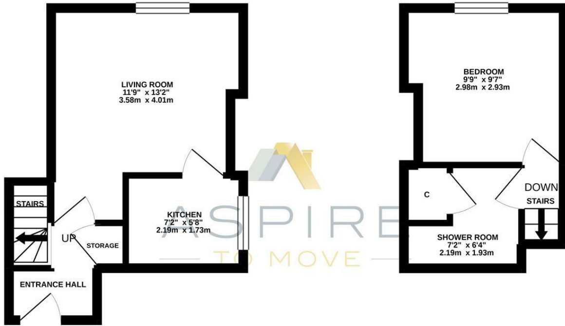
1ST FLOOR 148 sq.ft. (13.7 sq.m.) approx.